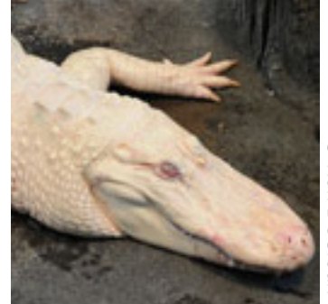
How old am I? Claude was born in 1995 in

Cousins of the boas While most boa constrictors live in the Americas, pythons are more likely to be found in Asia, Africa, or Australia.