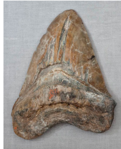
Carcharodon megalodon Extinct Megalodon shark