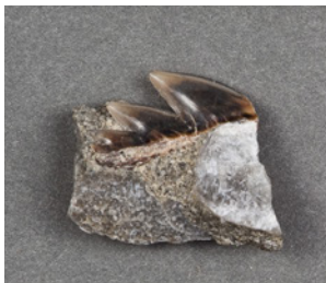
Notidanion boreale Extinct cow shark