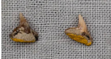
Chiloscyllium sp. Extinct bamboo shark

The fossilized shark teeth shown below are all from extinct species of sharks. They are kept in the geology research collections at the California Academy of Sciences.