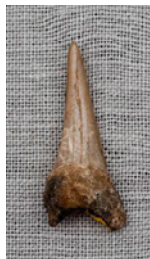
Isurus smithii Extinct mako shark