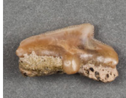
Squalus serriculus Extinct dogfish shark